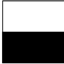
1/2 PAGE 10.5" w x 9.5" h