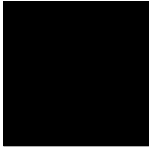
FULL PAGE 10.5" w x 19.5" h